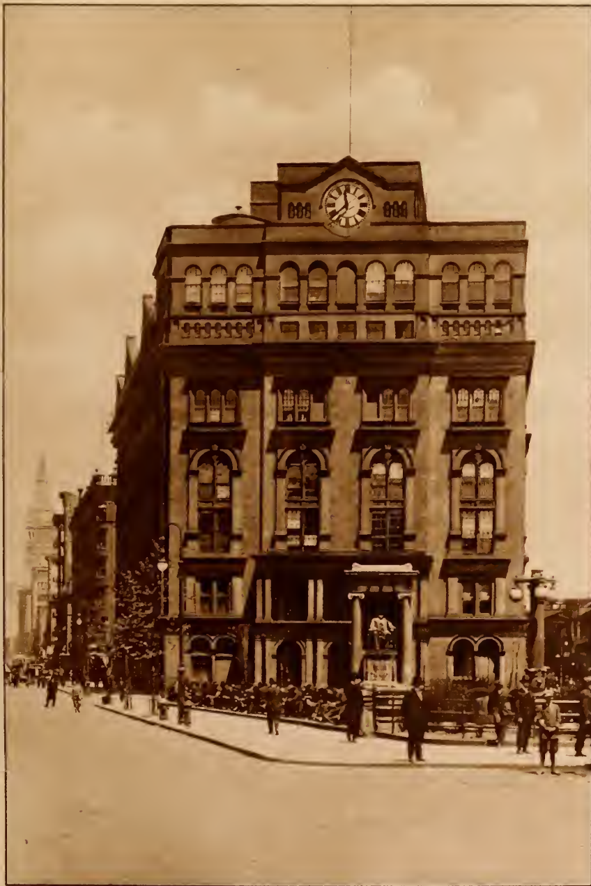
COOPER UNION, situated in Cooper Square, at 4th Avenue and 7th Street. Unique as an institute of learning and the scene of many socialistic debates.